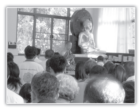
Listening to Dharma Talk